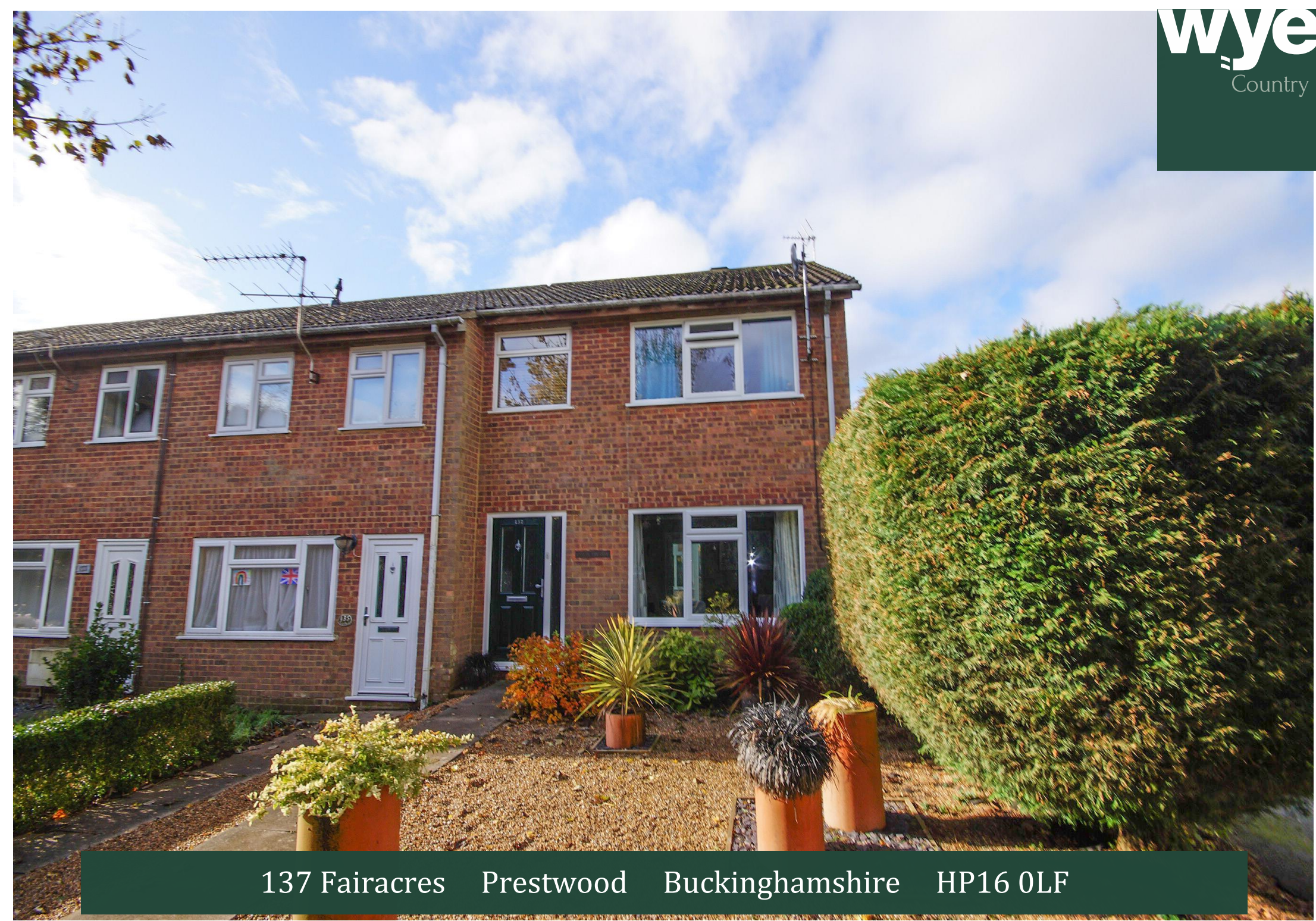
137 Fairacres Prestwood Buckinghamshire HP16 0LF